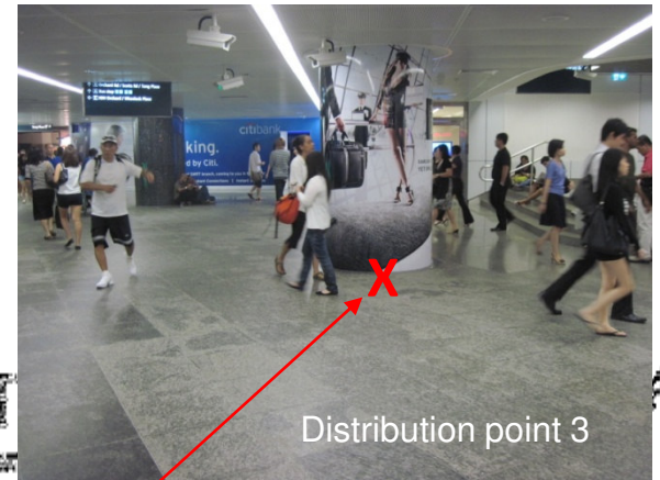
Distribution point 3