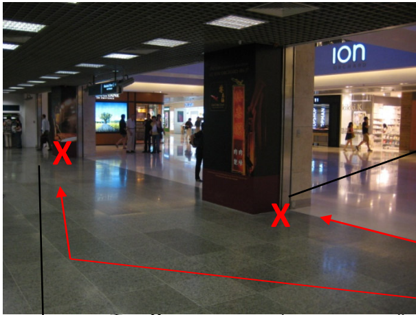
Distribution point 2