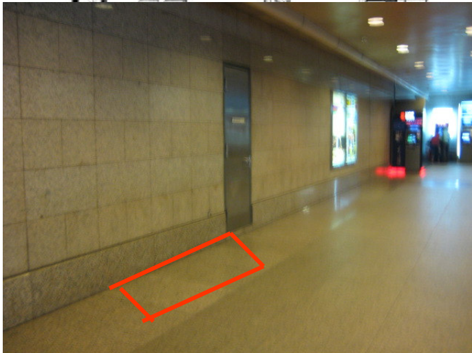
ES-01, 3m by 1m