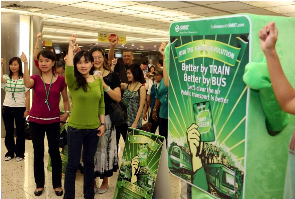
Eco-supporters and Greenie the mascot in a 'freeze' act at Raffles Xchange.