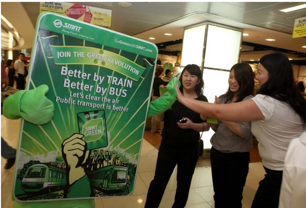
Raffles Xchange shoppers show their support for SMRT's Green Revolution.