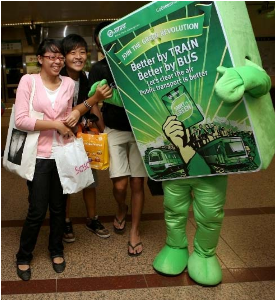
Young commuters striking a pose with Greenie the mascot.