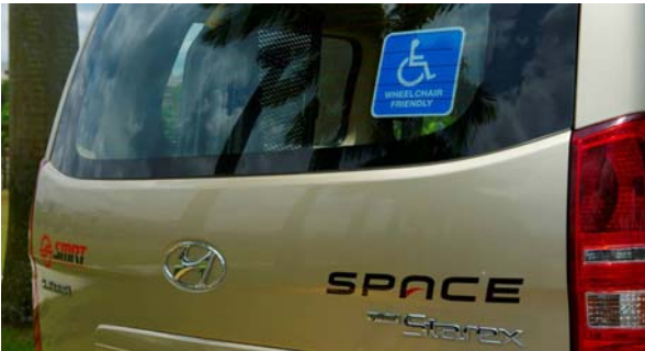
The All in one SMRT SPACE has a decal at the rear window to highlight its wheelchair-friendly features.