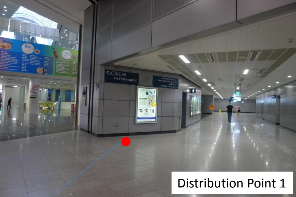
Distribution Point 1