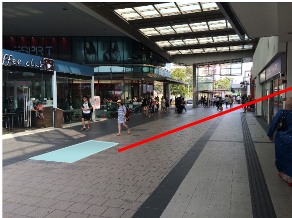
ES-01 2m x 1.5m